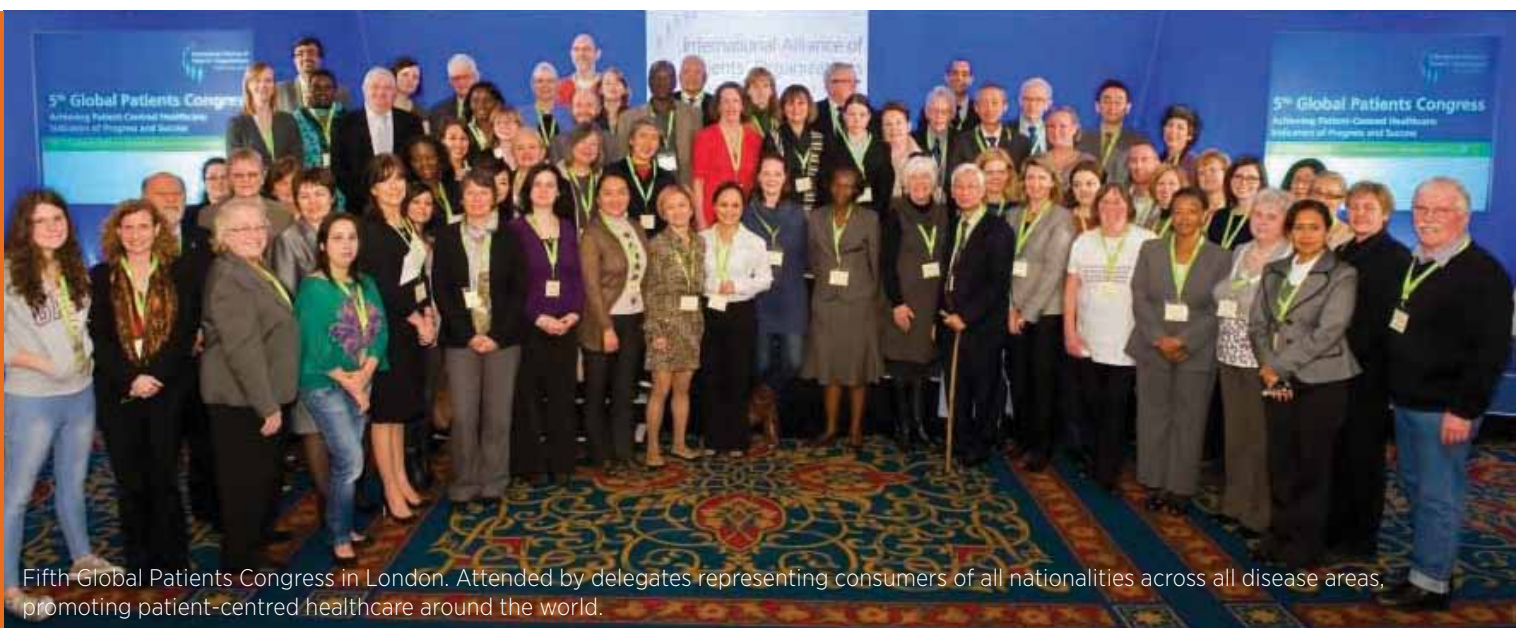
Fifth Global Patients Congress in London. Attended by delegates representing consumers of all nationalities across all disease areas, promoting patient-centred healthcare around the world.