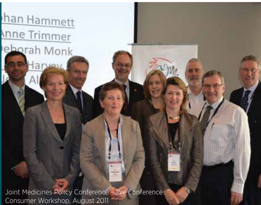
Joint Medicines Policy Conference – Pre Conference Consumer Workshop, August 2011